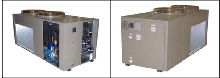
EI90 model shown